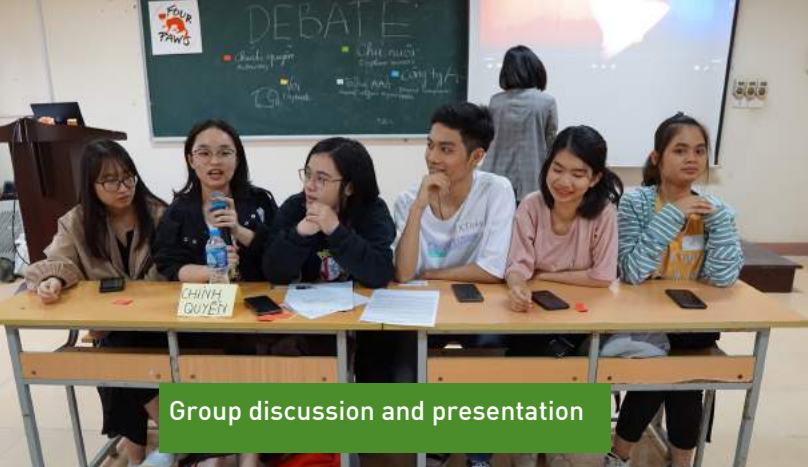
Group discussion and presentation