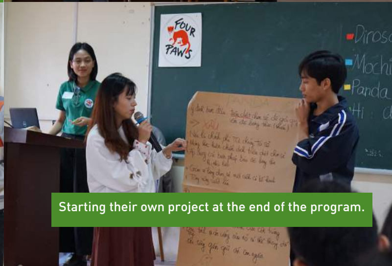
Starting their own project at the end of the program.