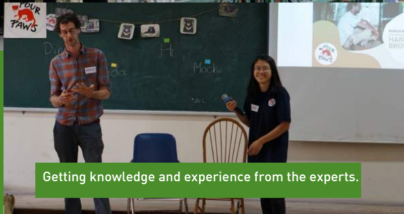
Getting knowledge and experience from the experts.

From Youth Engagement Program 2020 at the Faculty of Biology, National University of Science.