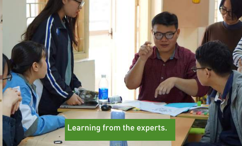
Learning from the experts.