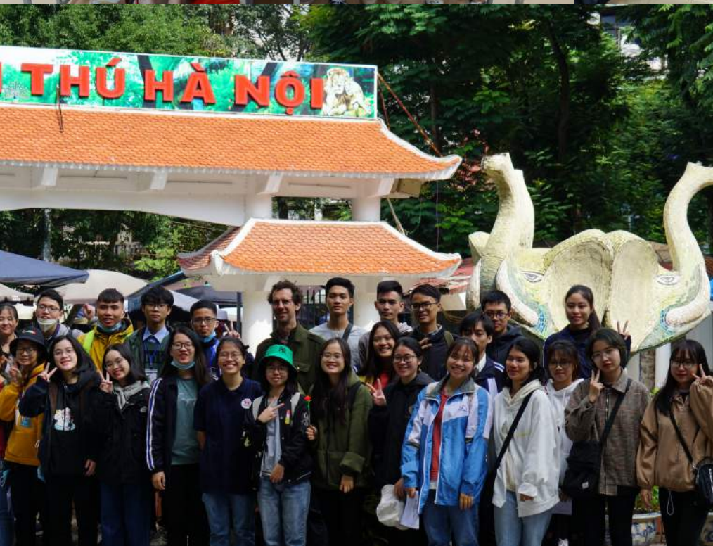
Hand-on experience in zoo and wildlife rescue facilities.