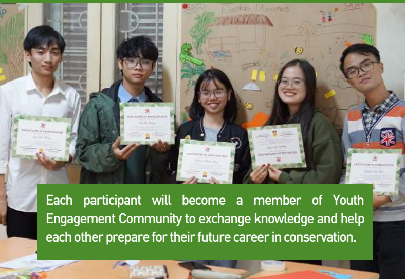
Each participant will become a member of Youth Engagement Community to exchange knowledge and help each other prepare for their future career in conservation.