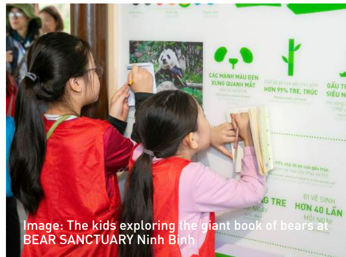
Image: The kids exploring the giant book of bears at BEAR SANCTUARY Ninh Binh

Events scale 40 - 60 children/ week, however we are flexible to be able to accommodate as many interested audience as possible.