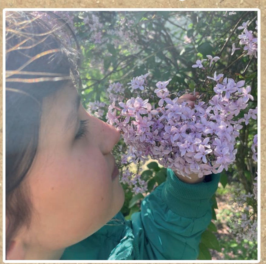
Marilou © Diana K. Weilandt

If nothing great smelling is growing, you can also use oranges, fragrant herbs or simply essential oils.