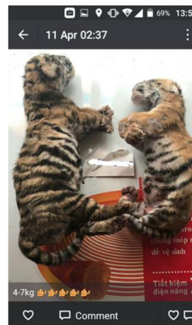
L-R: Tiger skin (online trade), tiger bone wine, tiger cubs (online trade)