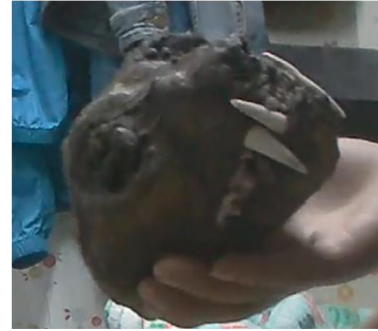
L-R: Clouded leopard skeleton for use by pharmaceutical company, China ©EIAimage, Leopard bone wine, China (online advert), Leopard skull for sale in China ©EIAimage

Whilst we welcome the renewal of the recommendations for CITES missions to tiger farming countries, we note that these recommendations were first adopted at CoP17 in 2016, and that the overarching Decision to phase out tiger farms and end trade, including domestic trade, in captive bred tiger parts was first adopted in 2007. Tiger farming countries have had ample time to amend legislation, stop the commercial breeding, introduce adequate mechanisms to ensure captive bred tiger parts do not enter trade, and yet these actions have been far from implemented as documented in responses received by the Secretariat to the questionnaires, as mentioned in SC75 Doc 9. Meanwhile the captive tiger population and the number of facilities implicated in trade is growing.